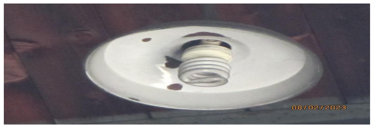
Shed 4 Lighting